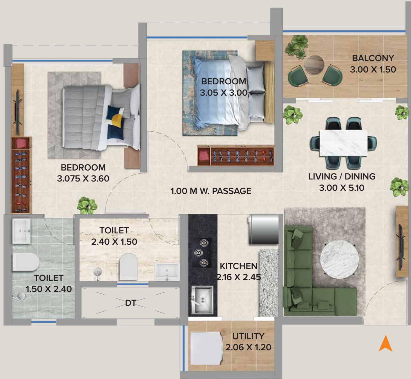
2 BHK TYPICAL UNIT PLAN