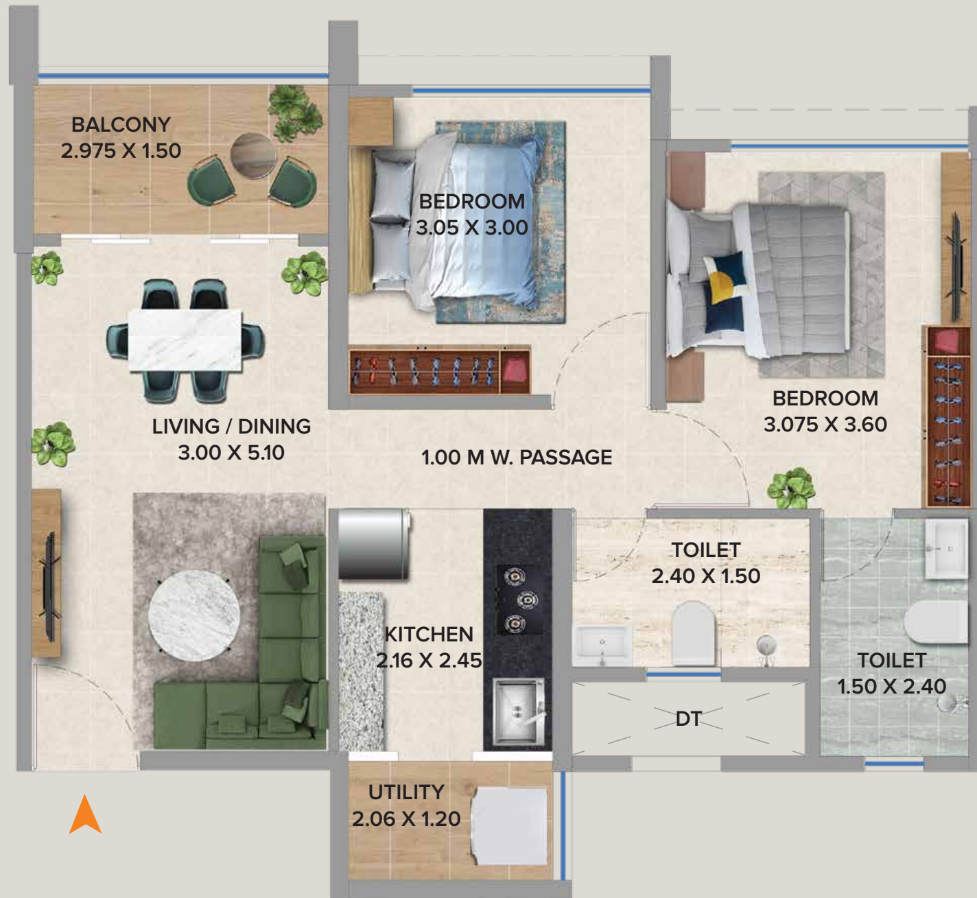
2 BHK TYPICAL UNIT PLAN