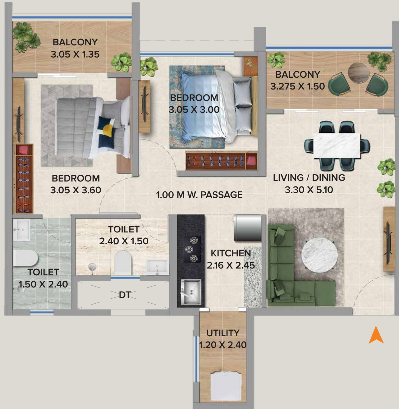
2 BHK TYPICAL UNIT PLAN