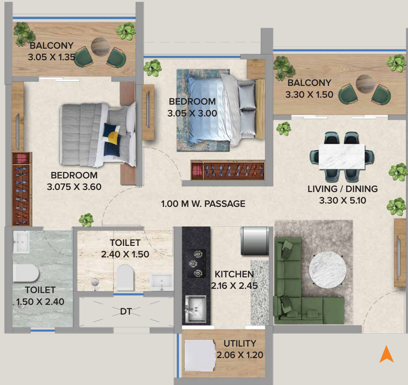
2 BHK TYPICAL UNIT PLAN